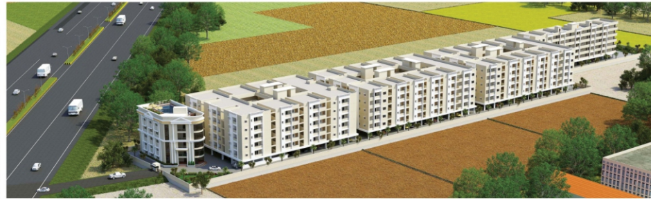
NORTHFACE GRANDEUR GOLLAPUDI, VIJAYAWADA