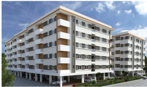
NORTHFACE LAVAKUSA, GUNTUPALLE, VIJAYAWADA